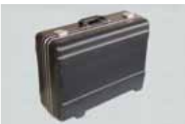
Carrying trunk case

Specifications and appearances are subject to change without notice.