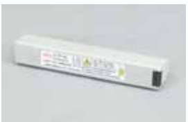
Spare Lithium ion battery