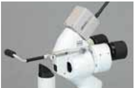
Main unit with video adapter