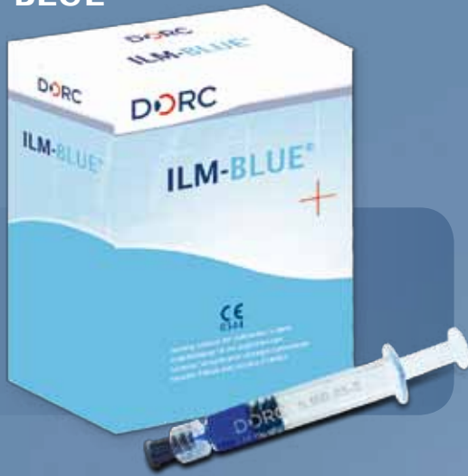
ILM.05S ILM-Blue®, 0.5ml Syringe (Sterile, box/5)