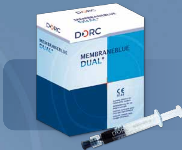
MBD.05S MembraneBlue-Dual® 0.5 ml Syringe (Sterile, box/5)